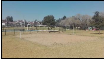
Volley ball net replaced.