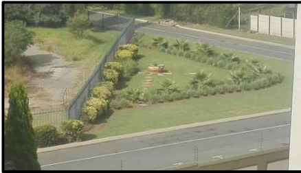
Grounds are neat and tidy. Beds turned over weekly. All weeds removed