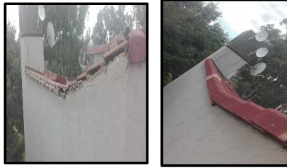
Repairs on roof and barge tiles